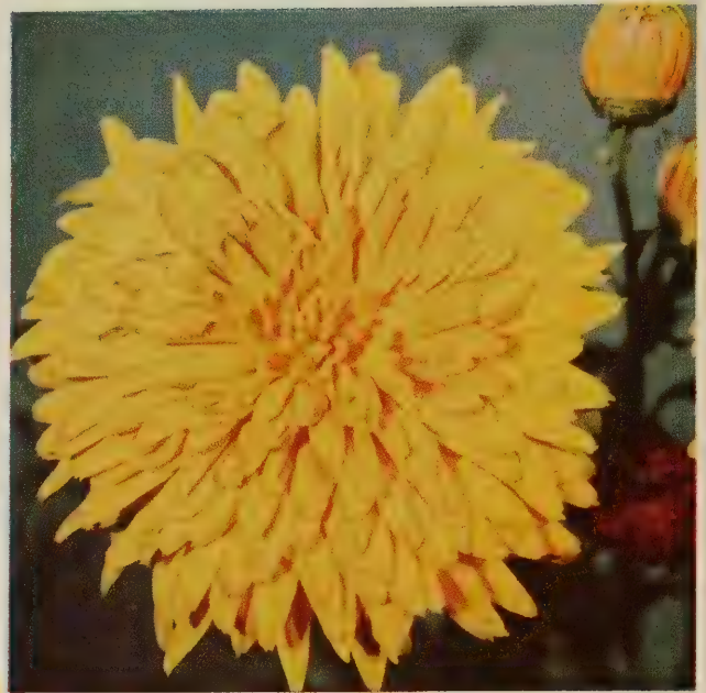
HOLIDAY. 75c each; 3 for $2.00